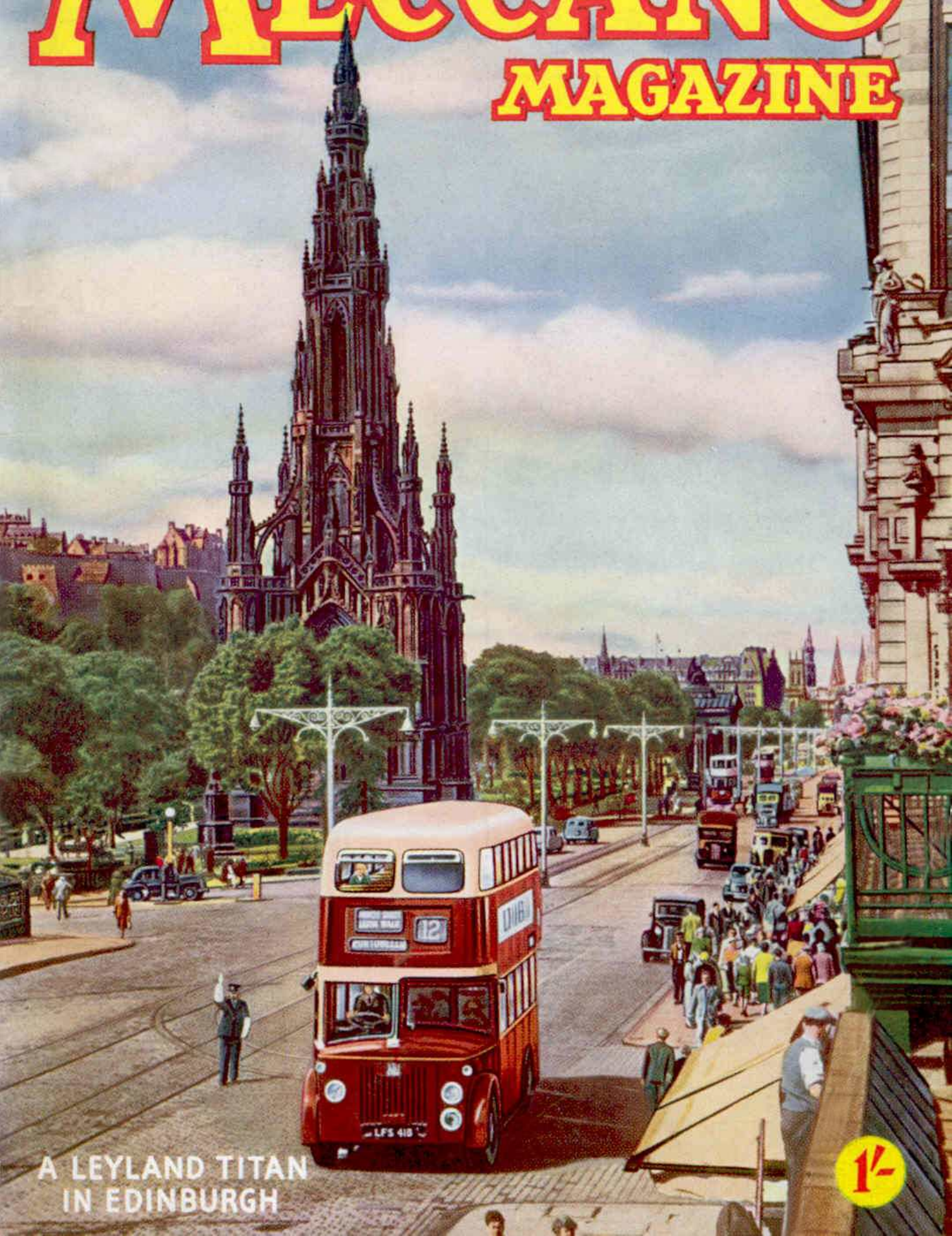
A LEYLAND TITAN IN EDINBURGH