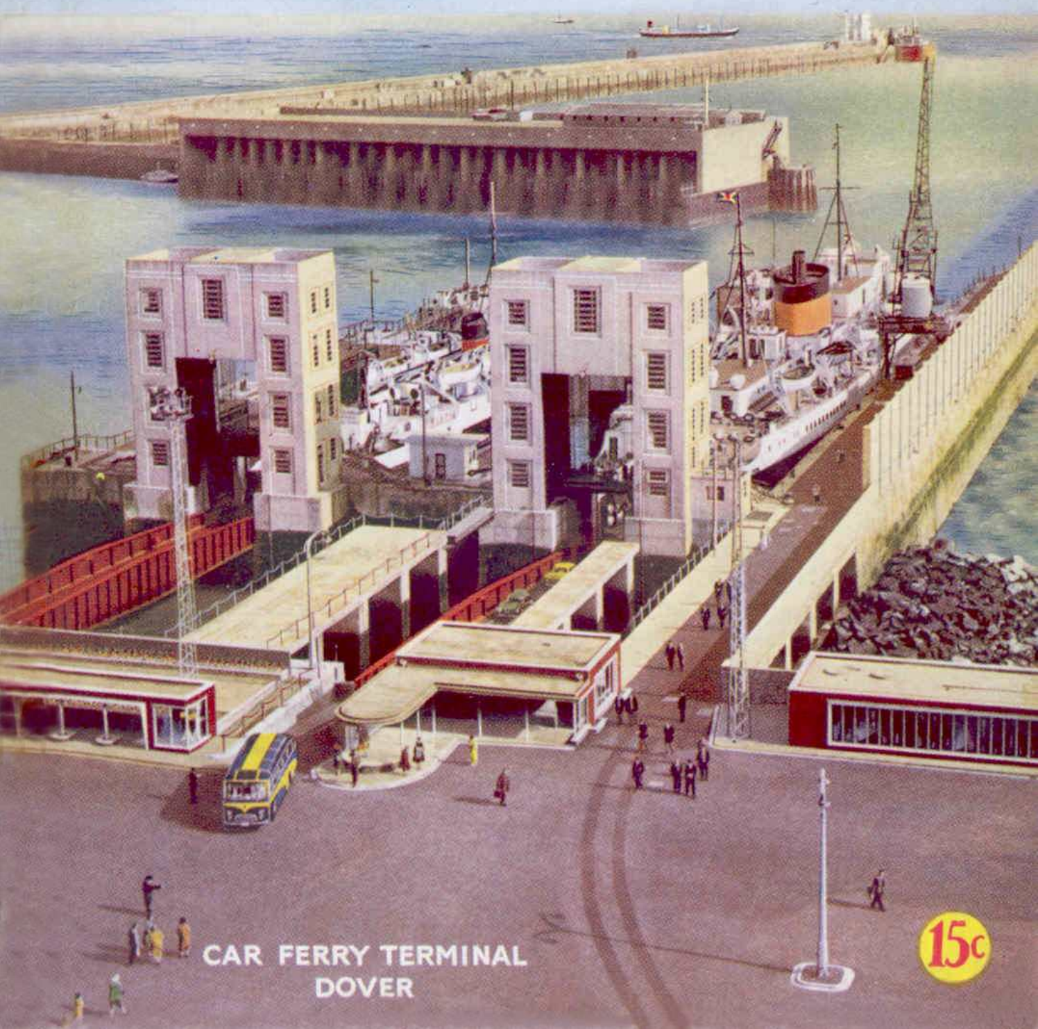
CAR FERRY TERMINAL DOVER