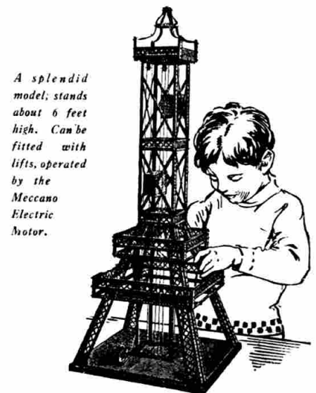
A splendid model; stands about 6 feet high. Can be fitted with lifts, operated by the Meccano Electric Motor.

Under the new Government regulations we are unable to send the "Meccano Magazine" to any one except those who directly apply to us for it. If, therefore, you wish to become a reader of the M.M. it will be necessary for you to forward to us a request for it to be sent to you regularly, accompanied by 2d. in stamps for postage on the next four issues.