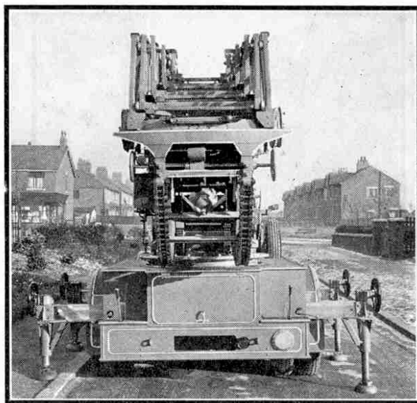
When the ladder is to be raised and extended, jacks on outriggers are lowered in order to give stability to the escape.