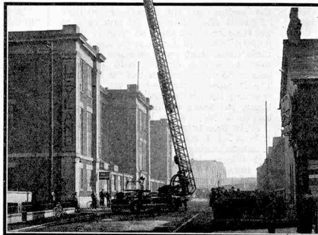
The ladder extended to its full length. It is in five sections with a total length of 132 ft., but similar escapes may have ladders up to 160 ft. long.