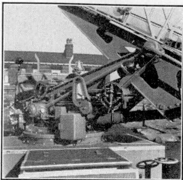
The operating controls of the Morris turntable fire escape ladder. In the centre is the special indicator that automatically stops operation when the ladder has been extended to its safety limit.

One of the most remarkable of these safety devices prevents the ladder from being extended beyond the safety limit at its various angles of elevation. This is an electrical installation that is governed by what is called the "field of operations indicator," which can be seen in the centre