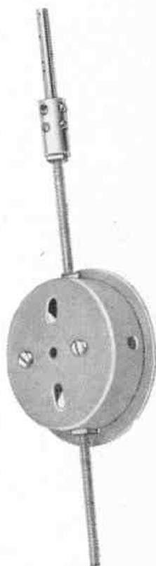
Fig. 2. The clock pendulum and weight "bob."

The pallet is a 2\frac{1}{2} " \times \frac{1}{2} " Double Angle Strip 27 bent to the shape shown in Fig. 4. It is attached by a bolt to a Collar on a 3\frac{1}{2} " Rod 28, mounted in the Triangular Plates and the lower holes of Strips 10. Three Washers