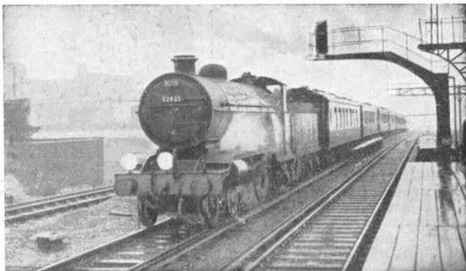
The R.C.T.S. Brighton Special of 19th October. No. 32425 is pressing on through London suburbs

I was able to share the excitement of the brisk running without the necessity for doing any timing myself. This was fine, because it enabled me to follow the