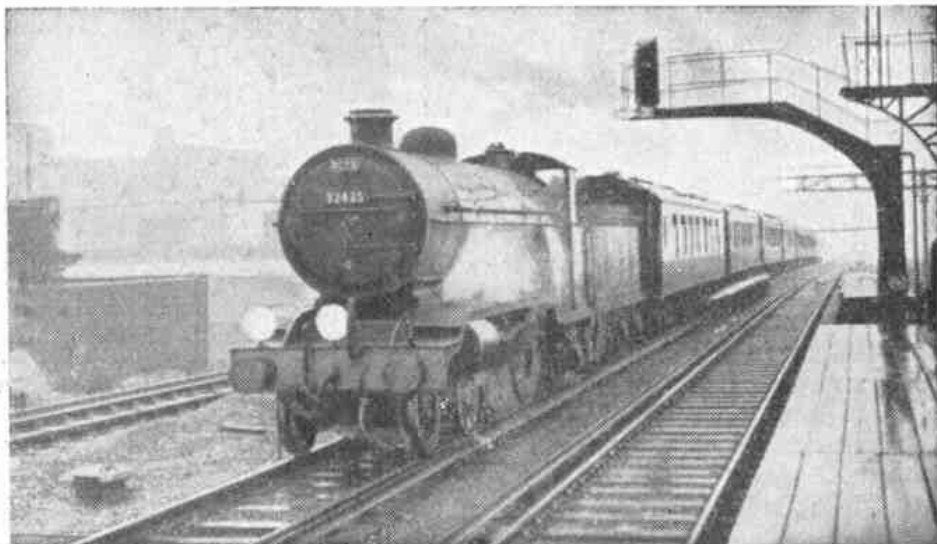
The R.C.T.S. Brighton Special of 19th October. No. 32425 is pressing on through London suburbs.

I was able to share the excitement of the brisk running without the necessity for doing any timing myself. This was fine, because it enabled me to follow the