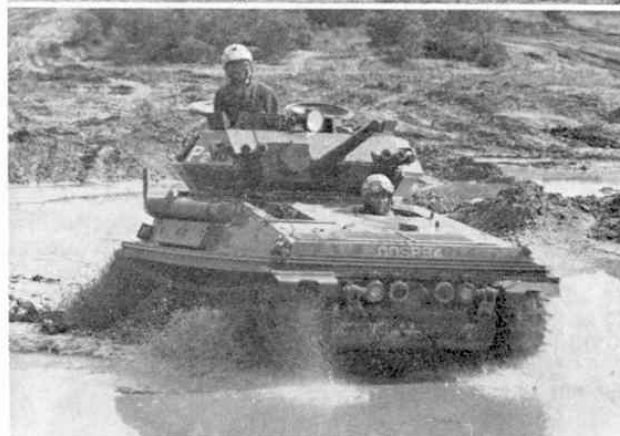
Upper: Scorpion prototype, the inner headlamps are infra-red. Note flotation screen foundation at track-guard level.