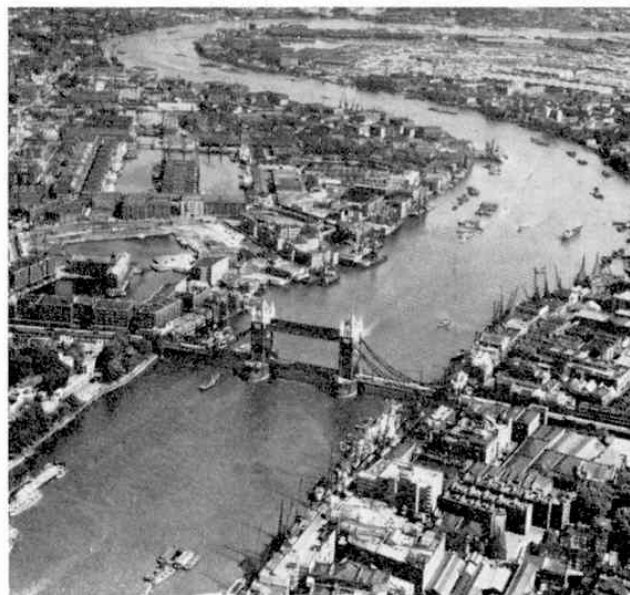
Because it can be lifted to let ships pass through, the Tower Bridge does not prevent vessels up to 10,000 tons from going up the Thames beyond the Port of London.

The writer wishes to express his gratitude to ALVIS LTD. for their kindness in providing data and photographs of the SCORPION family.