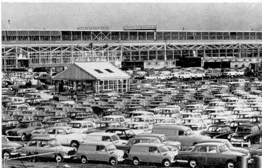
Real Austins this time—pictured outside the Austin Factory in Birmingham.

The next process for the castings is the giant phosphating plant where they are dipped in a chemical solution to ensure maximum adhesion when the enamel is applied. During all the processes mentioned and, indeed, until the end of their