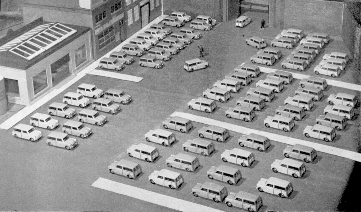
The striking realism of the Dinky Toys model of the Austin Seven Countryman—and the Morris Mini-Traveller, which is referred to on the next page—is seen in the photograph above, where the models have been used to represent a scene outside a distribution centre.

that when the pattern has been made it is taken to the car manufacturer for a last-minute, final check up on even the most minute details to ensure that the body casting which is to follow shall be as near perfect as is possible.