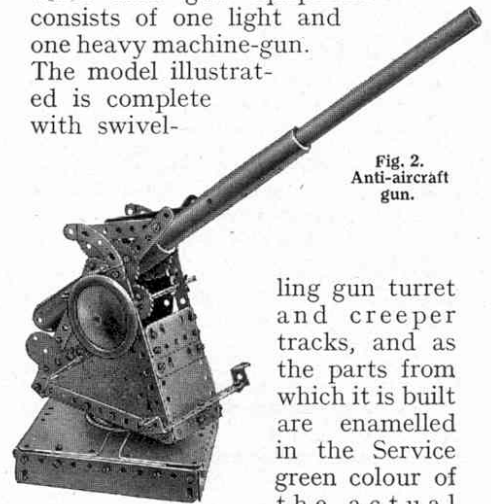
Fig. 2. Anti-aircraft gun.

Remarkably realistic models of tanks can be built from the special parts contained in the Meccano Mechanised Army Outfit, and a good example of these is the "Light" Tank shown in Fig. 5. It is based on one of the latest "Light" units in the British Army, and reproduces closely all the main external features of the actual machine. The "Light" tanks weigh about 5 tons. They are fitted with a 25 h.p. petrol engine and can travel at speeds up to 40 m.p.h., while their gun equipment consists of one light and one heavy machine-gun. The model illustrated is complete with swivel-