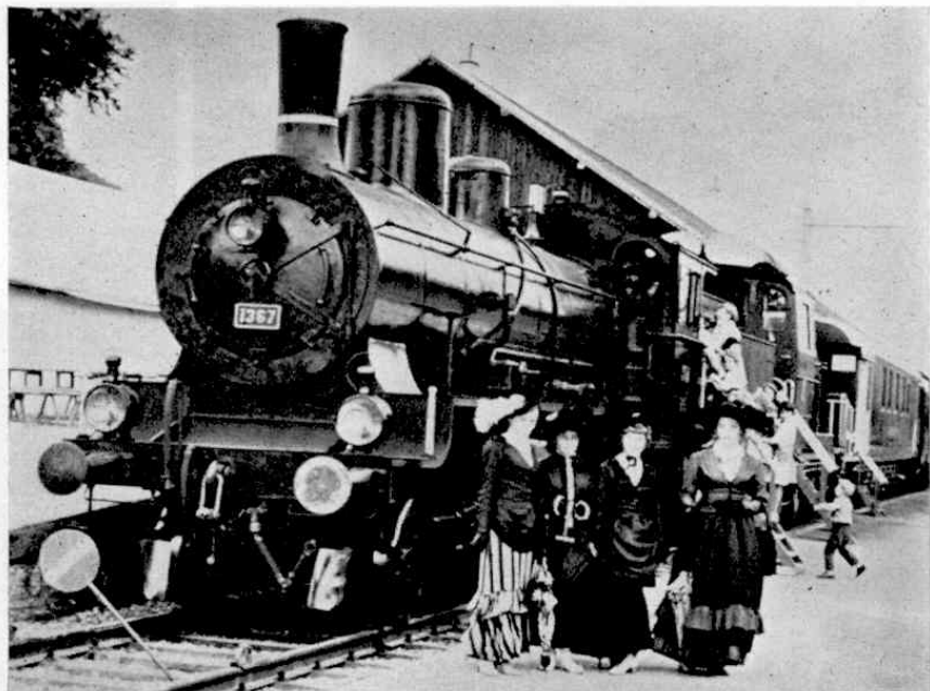
Travel a hundred years ago—this Swiss Federal Railways train of the 1860's is still operational and will be used for the re-enactment this summer of the first conducted tour of Switzerland.

Europe's first mountain railway which climbs to the top of the Rigi. Opened in 1871 it is another historic line which will have a part in this month's celebrations.