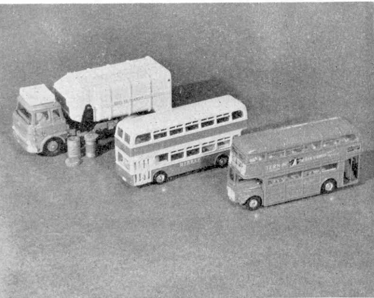
The 'public service' group includes, not only buses, but anything that performs a public service. Here we have No. 978 Refuse Wagon, No. 292 Atlantean Bus and No. 289 Routemaster London Bus.

Dinky Toy collecting can be a serious business and very enjoyable if you decide to build 'theme' collections. However, before you decide to embark on series or theme collecting, much careful thought must be given to the matter before you actually start buying. It is not advisable to draw out all your pocket-money and go charging down to the nearest model shop to buy everything in sight. If you did this, you would soon be in financial difficulties. There are more than 150 models in the current Dinky range, varying in price from 3s. 0d. to almost 30s. 0d., which will give you some idea of how much