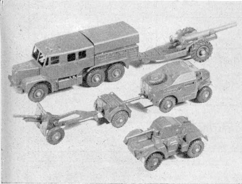
Examples from the 'army' section: from the back, No. 689 Medium Artillery Tractor, No. 693 7-2" Howitzer, No. 686 25-pounder Field Gun, No. 687 Trailer for 25-pounder Field Gun, No. 688 Field Artillery Tractor, No. 670 Armoured Car.

You must also remember that the range of available models does not remain unaltered for long. New miniatures are constantly being introduced and old ones withdrawn. Try to get those that you think might quickly disappear from the market because, once a Dinky has been withdrawn, there is little chance of it being re-introduced.