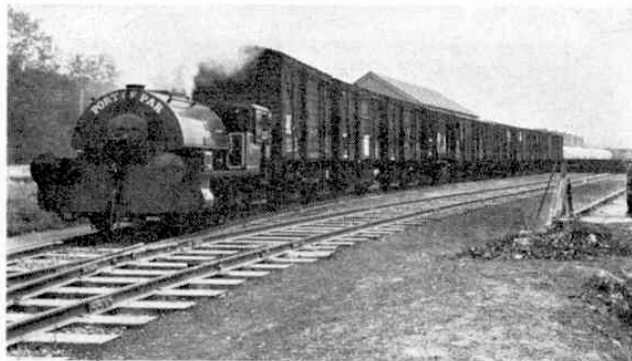
Port of Par Railway 'Alfred' hauling a line of wagons.

Bulk clay for the potteries is handled by B.R. liner trains, about 800 wagons being currently allocated to this traffic but all marshalling in the dock area is done by their two steam locomotives 'Alfred' and 'Judy'. Judging by the obvious care lavished upon them both are held in high esteem. Both were built by W. G. Bagnell Ltd. of Stafford, 'Judy' (works No. 2572 was built in 1937) and 'Alfred' (works No. 3053) is a comparative 'baby' born as recently as 1953. In their shining livery of light-green saddle-tank and cab, framed in a broad yellow line, with brown under-