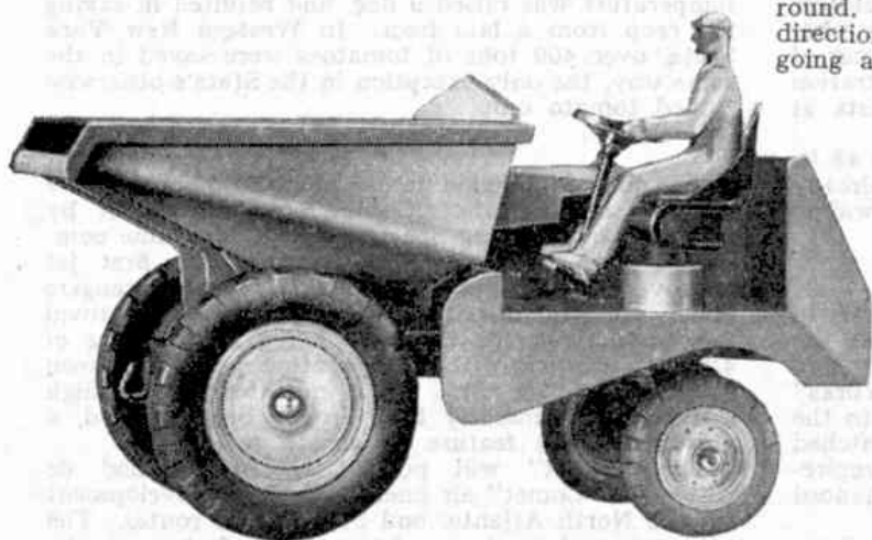
Dinky Supertoys Dumper Truck No. 562, with the driving seat turned for running with the bucket in front.

A further advantage of the new model is that its movement is not restricted to straight courses forward and backward. The front axle, that under the bonnet of the truck, can be adjusted to give curved runs either to the right or to the left, so that there is a wide variety of movement that can be adapted to the layout of various schemes in which the truck is employed.