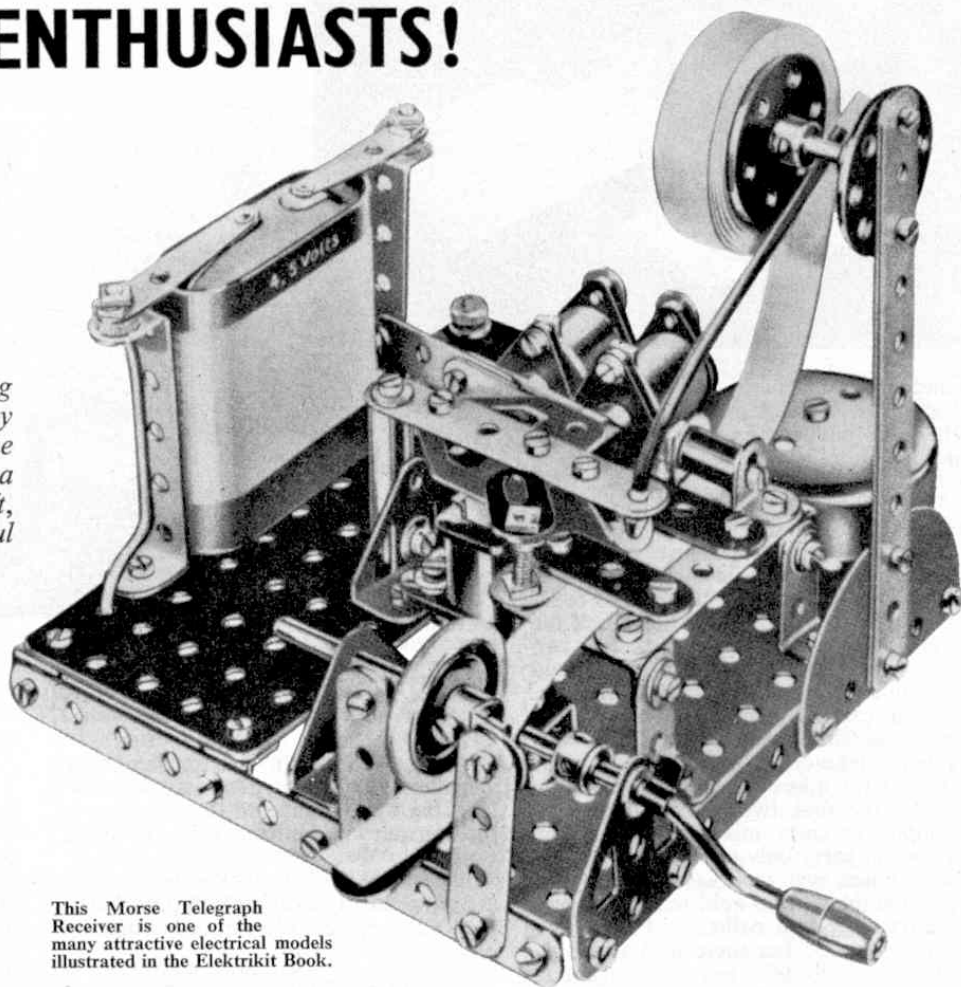
This Morse Telegraph Receiver is one of the many attractive electrical models illustrated in the Elektrikit Book.

Although such incidents as this are common in metal stockyards, shipyards, and other places where cranes are used to lift and transport heavy loads