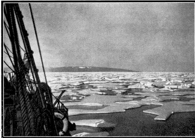
In polar regions. Passing through loose pack ice when approaching land in high latitudes. In order to force a way through the ice, advantage is taken of every opening or "lane" that presents itself.

touched, but rapid progress was made when the search of whalers and sealers for better hunting grounds revived interest in the Antarctic. The story of the heroic exploits of these men and of those who pioneered the way for them will be told in further articles in this series, and next month we shall deal with the voyages of the explorers who penetrated the heavy pack ice to find the real Antarctic continent.