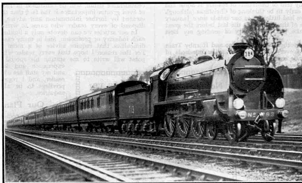
Down " Bournemouth Express " hauled by "King Arthur" class locomotive No. E.783 " Sir Gillemere ." For permission to reproduce this and the other illustrations to this article we are indebted to the courtesy of the Southern Railway

At the head of the train one of the "King Arthur" class usually may be found, but at times a "Lord Nelson" may have charge of the train. The locomotives that were in use in the pre-war period when the two-hour schedule