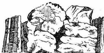
Fig. 1. Method of Constructing Early Breakwater*

At first these took the form of rough breakwaters, which served to break the full force of the waves, and so protected some natural inlet, converting it into a comparatively safe harbour. The first breakwaters were constructed by floating large stones by means of casks to the places required. The stones were sunk between strong oak piles that had previously been driven into the sea floor at