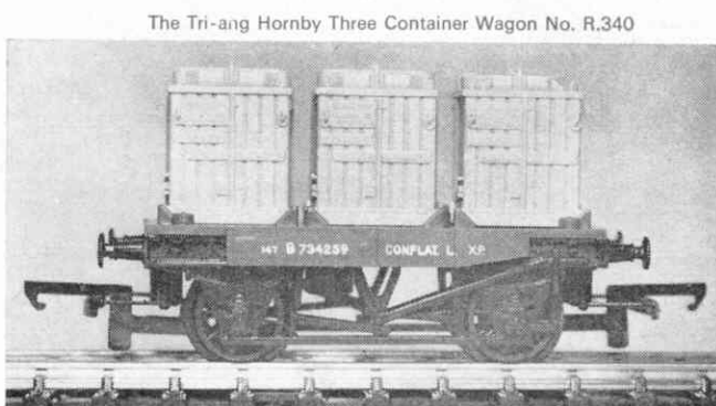
The Tri-ang Hornby Three Container Wagon No. R.340