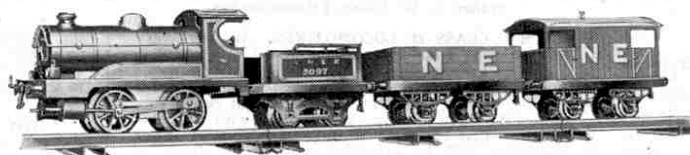
Hornby No. 1 Goods Set, the construction of which requires no less than 1,583 operations.