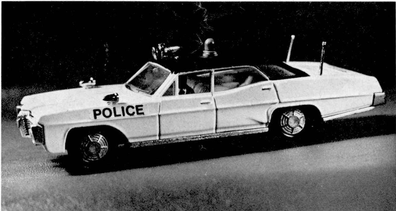
Dinky Toy No. 251 U.S.A. Police Car. Based on the Pontiac Parisienne, this new Dinky has all sorts of additional features.

terior and competition numbers. Speedwheels, the obvious choice for a Dinky Racer are fitted as standard, the wheels, themselves, carrying wide racing tyres at the rear. Finish is in flamboyant red, with gleaming black doors, matt black front panel and a moulded white interior.