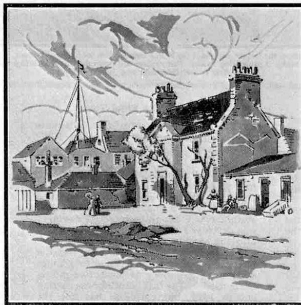
Watt's house in Delffield Lane, Glasgow

This month we commence a series of articles on the Lives of Famous Inventors, on somewhat similar lines to our existing series dealing with Famous Engineers. Almost all great engineers have been inventors to some extent while many inventors have been also engineers, and in many cases it is difficult to decide in which category to place certain men. In the present series, commencing with James Watt, the Father of the Steam Engine, we shall include men whose inventions rather than their engineering work have contributed towards the world's progress.