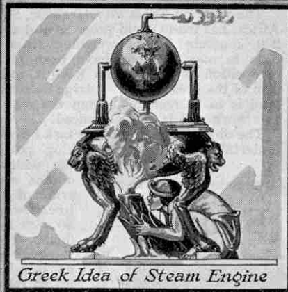
Greek Idea of Steam Engine