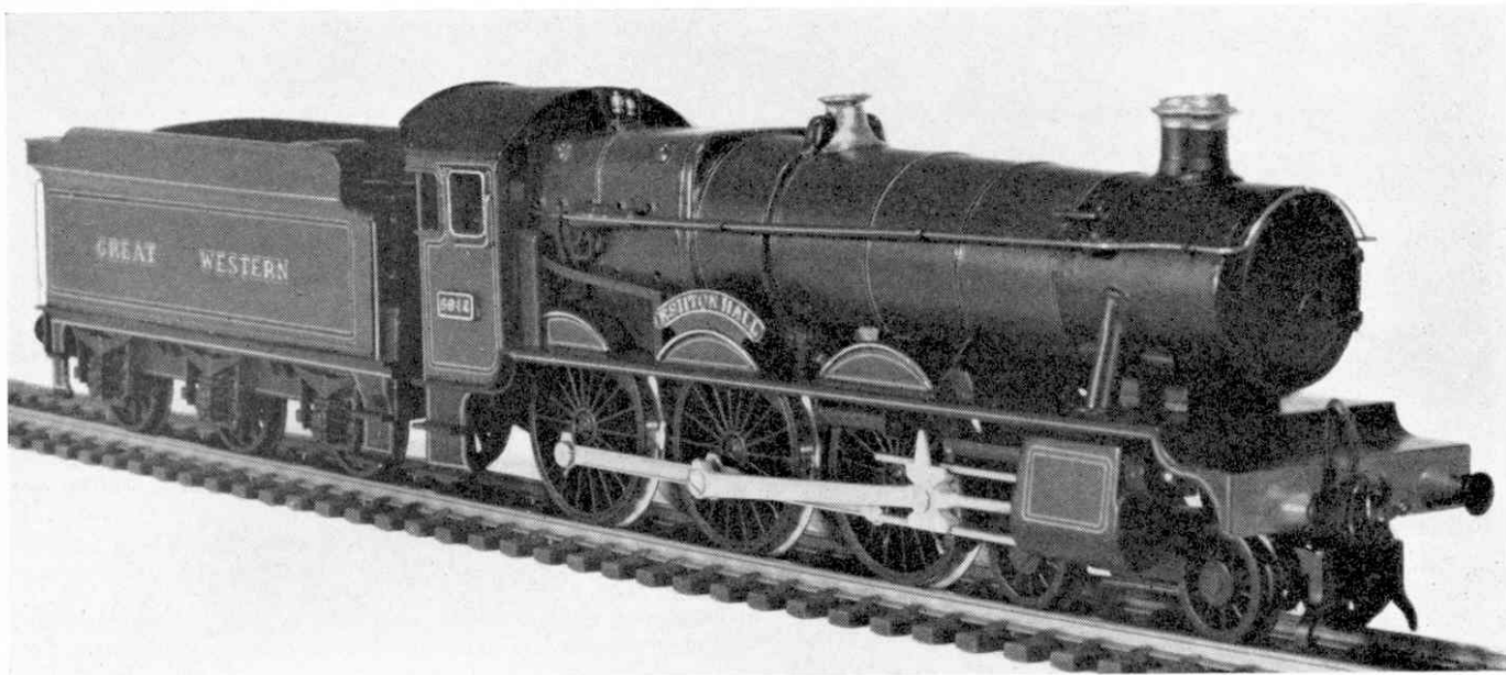
A fine model of the Wills 'Eshton Hall' fully painted and lined out.