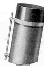
No. 138 J

Bibby Bros & Co. Haldin S.S. Co. J. Hay & Sons Ltd.