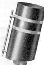
No. 138 O

Ellerman City Line. Ellerman Hall Line. Ellerman-Papayanni Line Ellerman Lines Ltd. (Westcott & Laurance Line Ltd.)