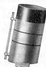
No. 138b Isle of Man S.P. Co. Ltd. Red funnel, broad black band at top. Two thin black bands round middle.

Anglo-Saxon Petroleum Co. Ltd. Australind Steam Shipping Co. Ltd. Bank Line Barrie, Charles & Son. Booker Line. British Mexican Petroleum Co. Ltd. Dunn, Chas. G. & Co. Ltd. Elders & Fyffes Ltd. Gillespie & Nicol. Hogarth, H. & Son. Hull & Netherlands S.S. Co. Ltd. Jacobs, John I. & Co. Ltd. King Line Ltd. Shaw Savill & Albion Co. Ltd.