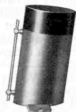
No. 138h G.W.R. Steamers—Fishguard. Red funnel with broad black band at top.

American Line. Aster Shipping Co. Ltd. Bristol Steam Nav. Co. Ltd. Brown, Atkinson & Co. Ltd. Cleaves, W. V., Anthracite Collieries Ltd. Currie, James & Co. Donaldson Line. Gardner, J. & A. & Co. Japp Hatch & Co. Ltd. Nisbet, Geo. & Co. Sloan, Wm. & Co. Stephenson Clark & Co. Ltd. Yorkshire Coal & S.S. Co. Ltd.