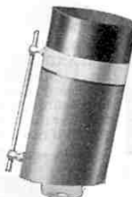
No. 138 M

Evan Thomas Radcliffe & Co. Sharp S.S. Co. Ltd.