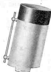
138g White Star Line. Buff funnel. Broad black band at top.