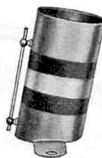
No. 138 I

Holland America Line. Buff funnel. White band round middle flanked by two green bands.