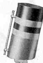
No. 138 P

Nelson Line. Red funnel. Broad black band at top with three narrower bands (black band and two white bands) immediately below.