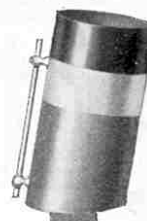
No. 138 D

Wilson's, & North East- ern Railway Shipping Co. Ltd.