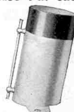
No. 138 N

Holland America Line. Buff funnel. White band round middle flanked by two green bands.