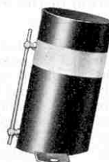
No. 138w Moss Line Black funnel with broad white band.

Alkinson, E. P. & Sons. Belfast S.S. Co. Ltd. Chambers, J. & Co. Commonwealth & Dominion Lines Ltd. Glen & Co. Houston, R. P. & Co. Lang & Fulton. London S.S. & Trading Corporation Ltd.