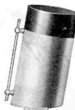
No. 138 X

Nelson Line. Red funnel. Broad black band at top with three narrower bands (black band and two white bands) immediately below.