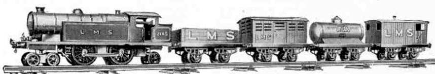
No. 2 Mixed Goods Set L.M.S.

This realistic Goods Train consists of the new 4-4-2 Tank Locomotive, as supplied with No. 2 Special Goods Set, Hornby Wagon No. 1, No. 1 Cattle Truck, Petrol Tank Wagon, Brake Van and set of Rails, including a Brake and Reverse Rail, by means of which the Locomotive may be braked or reversed from the track. The Locomotive is supplied in the regulation goods traffic colours—black for L.N.E.R., L.M.S.R. and S.R., and dark green for G.W.R. If required, the set may be obtained with Locomotive in passenger train colours—green for L.N.E.R., red for L.M.S.R., and dark green for G.W.R. and S.R. Gauge 0 ... Price 37/6