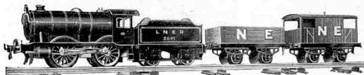
No. 1 Special Goods Set L.N.E.R.

This set is similar to the No. 1 Special Passenger Set, but contains one Wagon and one Brake Van in place of the Pullman Coaches. The Locomotive and Tender are supplied in the regulation goods traffic colours—black for L.N.E.R., L.M.S.R. and S.R., and dark green for G.W.R. If required, the set may be obtained with the Locomotive and Tender in passenger train colours—green for L.N.E.R., red for L.M.S.R., and dark green for G.W.R. and S.R. Gauge 0 ... Price 30/-