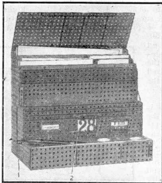
Fig. 2. A combined writing cabinet, letter rack and calendar.

Parts required to build the Writing Cabinet: 18 of No. 1; 16 of No. 1a; 7 of No. 2; 17 of No. 3; 21 of No. 5; 6 of No. 6a; 2 of No. 8; 2 of No. 8a; 4 of No. 10; 8 of No. 11; 44 of No. 12; 2 of No. 12a; 360 of No. 37; 12 of No. 38; 4 of No. 48a; 5 of No. 52; 10 of No. 52a; 4 of No. 53; 6 of No. 53a; 7 of No. 70; 3 of No. 73; 2 of No. 108; 7 of No. 114; 4 of No. 125; 1 of No. 192; 6 of No. 197.