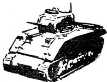
TABLE TOP BATTLES

This is the first of a series of articles which will deal with the building of scale model military vehicles and equipment to form a Wargames Army. Wargaming, apart from being a fascinating hobby in its own right, enables military models to be used rather than stand around gathering dust. Detailed information on military vehicles is not always easy to obtain, but this is no drawback, as Wargames models can be as simple or as detailed as you wish. After all, a real-life general is not too worried about the look of his forces, so long as they win the fight!