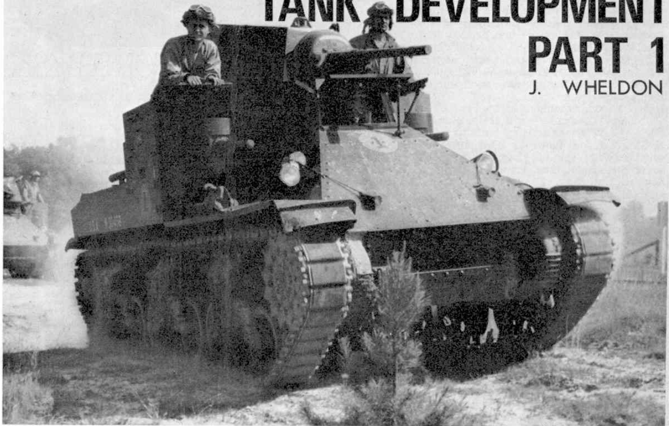
The French "Char B" designed in the mid-twenties, built in the thirties by Renault and used in 1940.