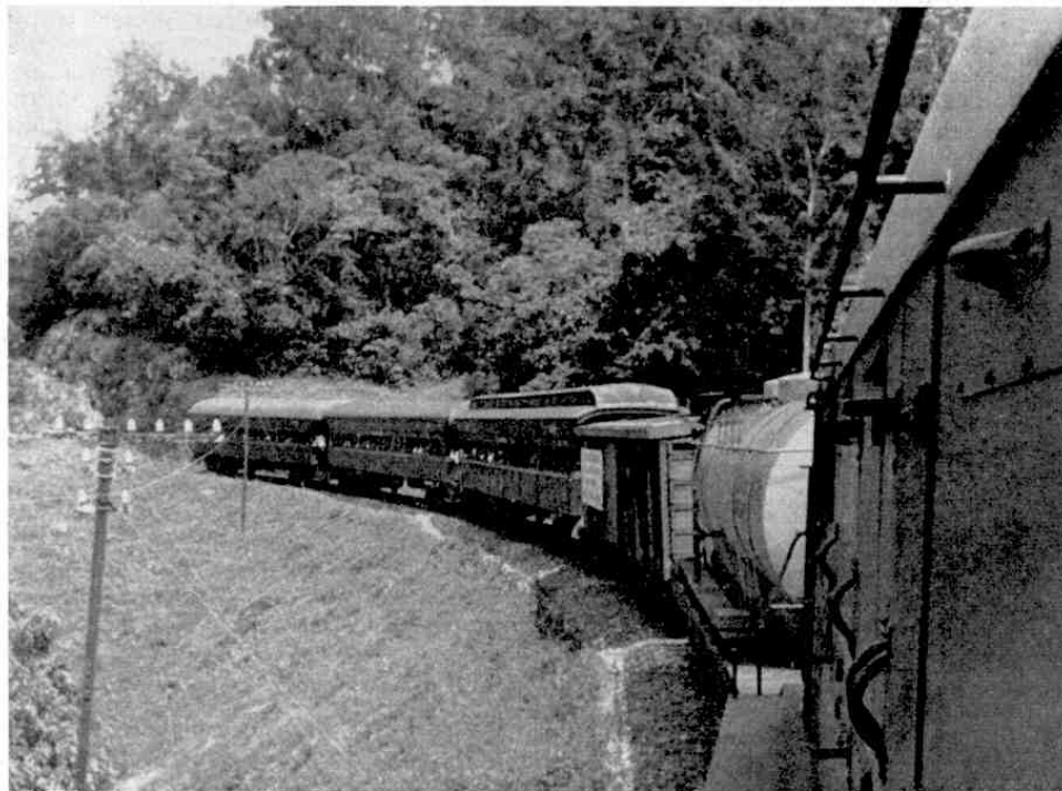
At Kingston Motive Power Depot steam locomotive No. 55 (above) is turned by hand outside the Roundhouse. Left: View from the cab of an English Electric diesel-electric locomotive, looking back along the train in the mountain section of the Kingston-Montego Bay line.

At busy stations there is an additional safety precaution—the Pilotman. There is only one Pilotman at each centre and trains are not allowed to move in the station area unless he is