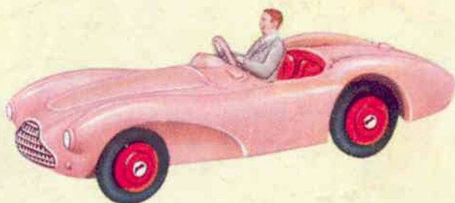
No. 104 Aston Martin DB3S (Touring finish) Length 3 \frac{3}{8} in. 3/-