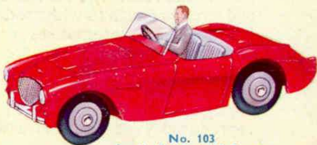
No. 103 Austin-Healey 100 Sports (Touring finish) Length 3 \frac{3}{8} in. 3/-