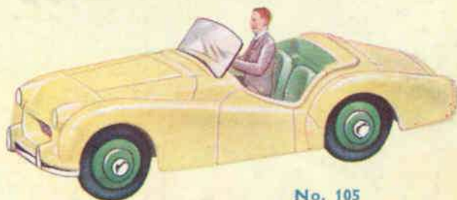
No. 105 Triumph TR2 Sports (Touring finish) Length 3 \frac{3}{8} in. 3/-

All prices include Purchase Tax MADE IN ENGLAND BY MECCANO LTD., BINNS ROAD, LIVERPOOL 13