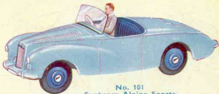
No. 101 Sunbeam Alpine Sports (Touring finish) Length 3 \frac{1}{8} in. 3/-

These five popular British sports cars are now available in touring finish with civilian drivers. Each model is available in a choice of two colour schemes. They make gay additions to any Dinky Toys collection.