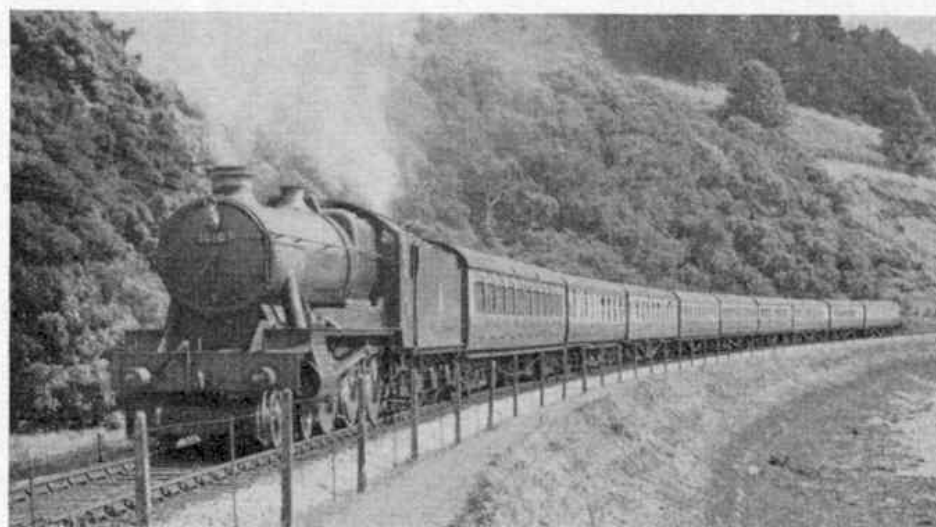
No. 1010 "County of Caernarvon" is seen here pulling away from Kingswear up the estuary of the River Dart with a local passenger train for Newton Abbot.

starting at 7.34 a.m., and remains on the branch throughout the day, returning to shed during the early evening, sometimes with a light pick-up goods train. When the author has been on holiday in this area, it has been a joy to see good numbers of people flocking out of trains here to patronise the Brixham Whippet , as it is locally known. Another "named" train!