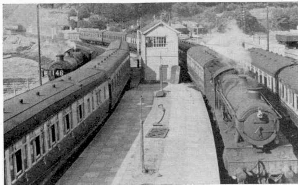
No. 4920 "Dumbleton Hall" arrives at Kingswear with a down semi-fast train, while No. 7004 "Eastnor Castle" after working the down "Torbay Express" waits in the background to return to Newton Abbot sheds.

line at first runs alongside the sea shore and then commences twisting and bending its way up the incline, passing a holiday camp, with caravans on one side of the line and tents on the other side, the sea and the great sweep of Tor Bay being in sight for most of the way. By the time it makes its way over Broadsands Viaduct the gradient has steepened to 1 in 60, and then a long right hand