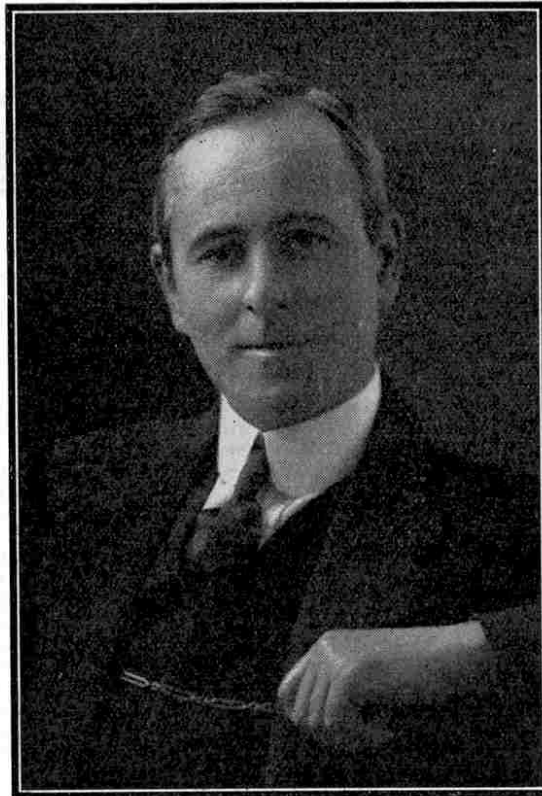
A Pioneer of Flight: Mr. A. V. Roe

As readers of the "M.M." know, there are various kinds of aeroplanes, and of these the tractor biplane seems to be the most popular at present. The monoplane is coming forward, however, and offers distinct advantages in simplicity and in stream-lining, which can more readily be carried out, both in commercial and fighting aircraft. In the latter case, guns may be mounted in such a position that there are practically no obstructions to the field of fire in any direction even when two gunners are in action.