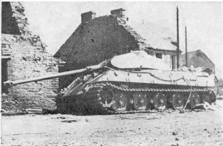
Royal Tiger, knocked out in France 1944. An example of this vehicle is on display at the R.A.C. Tank Museum, Bovington, Dorset