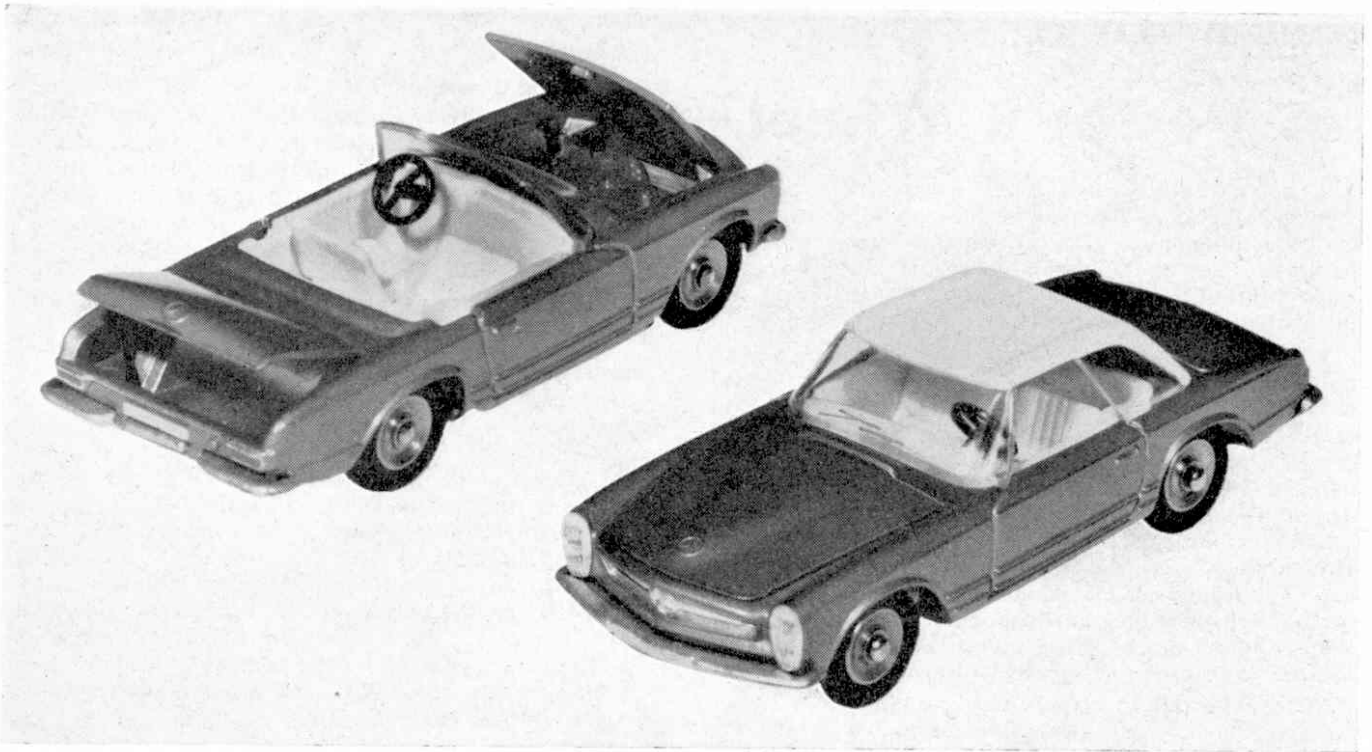
Dinky Toys No. 516, Mercedes-Benz 230SL comes complete with a removable 'hardtop' hood.