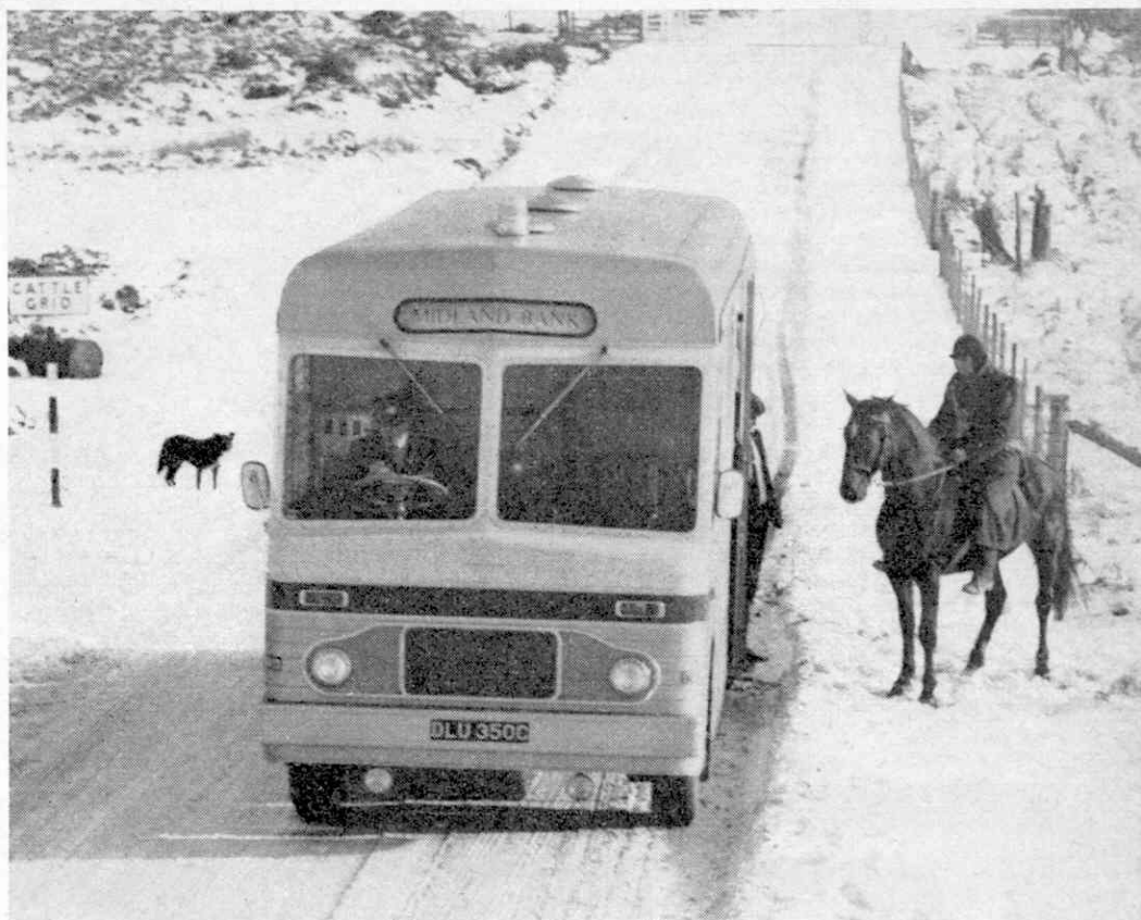
Above: the prototype of the latest Dinky Toy in a chilly winter setting Below: much larger than life, the automatic Mini—an automatic choice

The immense advantages of such a vehicle are obvious. It immediately does away with the need for a chain of costly sub-branches, made even more costly because they stand idle for a good proportion of the working week. It requires only one 'crew' and, perhaps most important to the customer, it brings banking