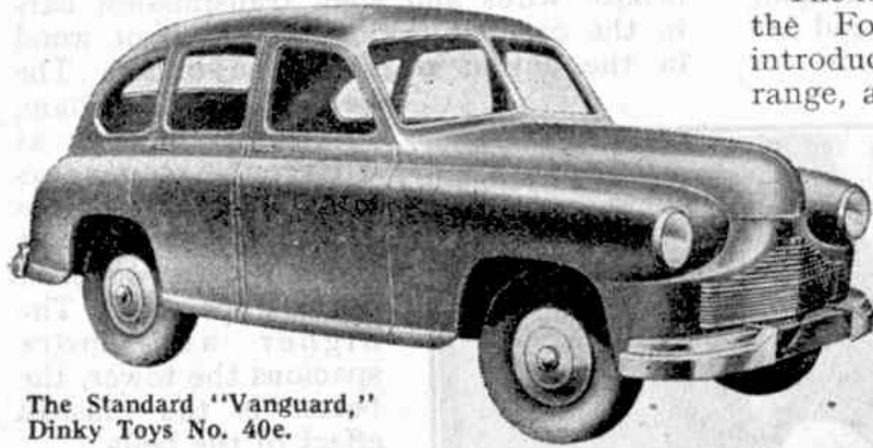
The Standard "Vanguard," Dinky Toys No. 40e.

WITH the coming of the now famous "Vanguard" the Standard Motor Co. Ltd. concentrated on the production of this single model, and other Standard cars have now been dropped entirely. The model is a splendid example of modern