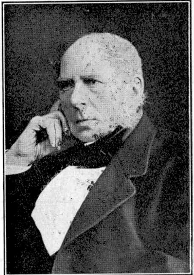
Sir Henry Bessemer.

firing strain. He first tried a fused mixture of cast iron with steel, but this was no improvement. Continuing his experiments, he noticed one day, while melting pig-iron in a furnace, that certain pieces of the iron, which had been exposed to the air blast, were still unmelted. On examination he found that these pieces were just hollow shells of decarbonised iron, the carbon having been burned out of them by the air blast.