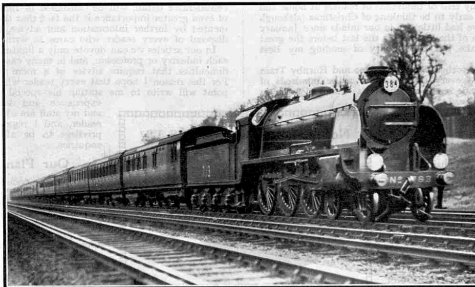
Down " Bournemouth Express " hauled by "King Arthur" class locomotive No. E.783 " Sir Gillemere."

At the head of the train one of the "King Arthur" class usually may be found, but at times a "Lord Nelson" may have charge of the train. The locomotives that were in use in the pre-war period when the two-hour schedule