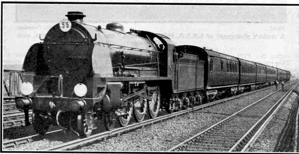
E.777 "Sir Lamiel" on the "down" "Bournemouth Limited," passing Durnsford Road Power Station. The locomotive is fitted with smoke-box deflectors in order to carry the exhaust steam clear of the cab windows

While flying along in this manner between Basingstoke and Woking we remember that along this splendid length of track signalling is entirely automatic. Except at stations and certain points where for special reasons signal-boxes yet remain, the signals are electro-pneumatic and are worked by the trains themselves. An installation of this kind is of the greatest value on this extremely busy portion of the track, over which a frequent service of tightly-