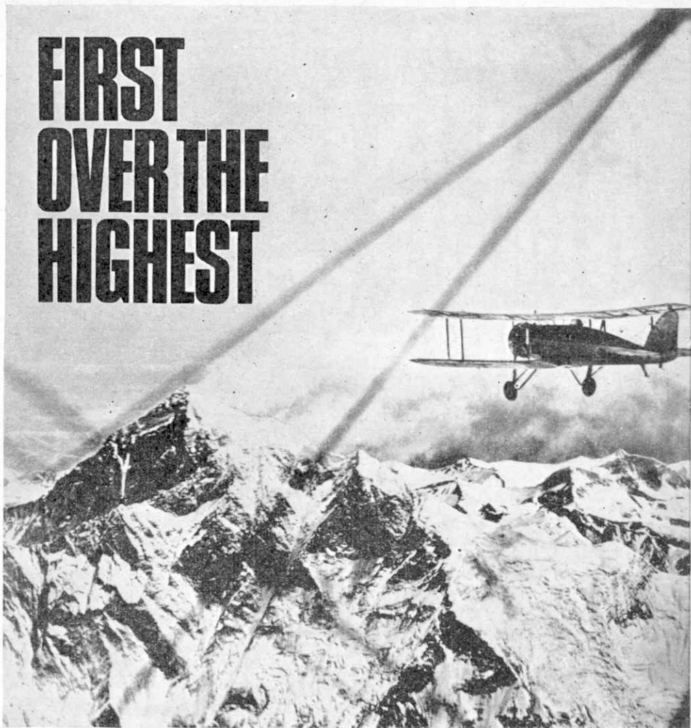
Over Everest! The Houston-Westland P.V.3

It started out as bit of a lash-up. A makeshift development of a World War 1 aeroplane, but it eventually led to the first over-Everest flight and became one of the R.A.F.'s most faithful workhorses. Turn to page 20 for our Wapiti plastic project.