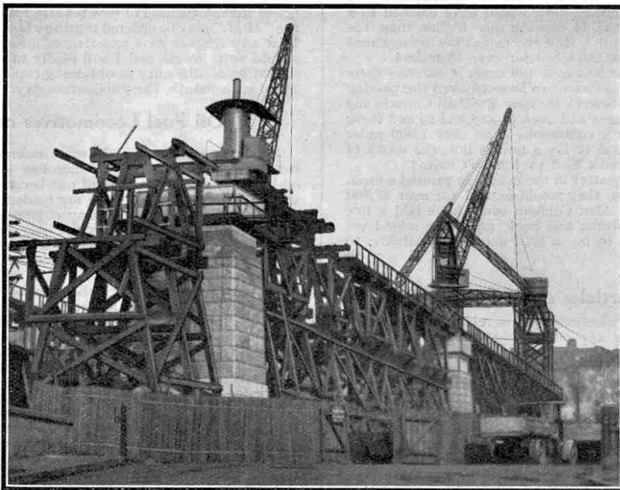
This photograph shows the progress made on the southern approach

The greatest pressure that each of the steel bearings—there will be two at each end—will have to carry will be 40,190,000 lb. Of this tremendous stress 73 per cent. will be due to the