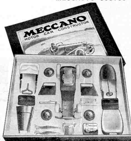
MECCANO MOTOR CAR CONSTRUCTOR OUTFIT No. 1

MECCANO LTD. - BINNS ROAD - LIVERPOOL 13