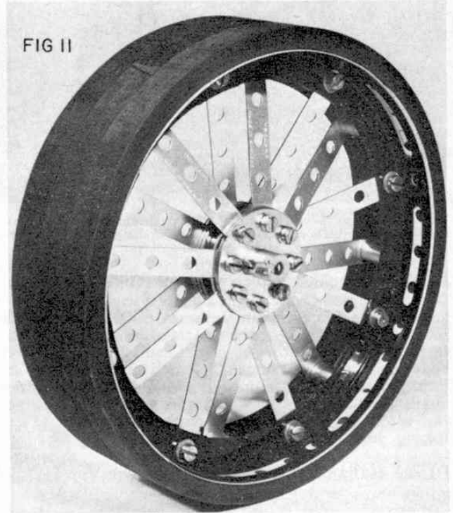
Fig. 11: A completed 16-spoke dished wheel for a Showman's Road Locomotive. The outer rim of the wheel is made from 5½ × 1½ in. Flexible or Plastic Plates trapped by rubber tyres or bands.

last resort, black fabric insulating tape can be wound on to make very effective-looking traction engine "tyres". Agricultural engines can be left, with advantage, with the "bare" look.