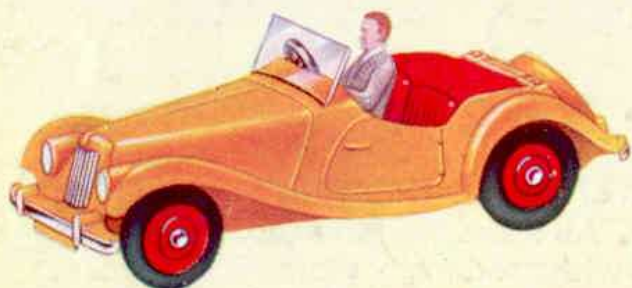
No. 102 M.G. Midget Sports (Touring finish) Length 3 \frac{1}{4} in. 3/-