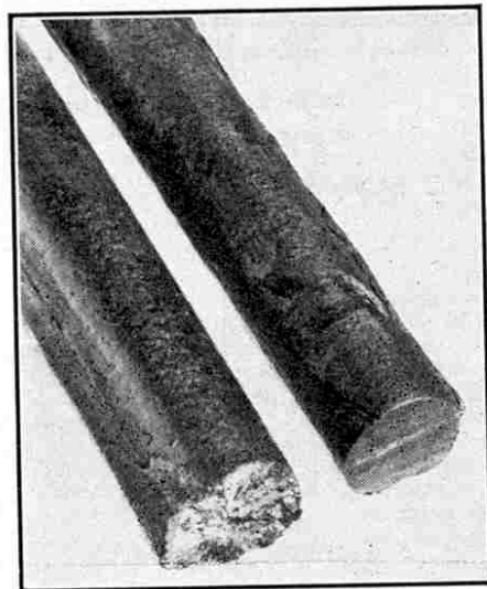
A rod of antimony, on the left, compared with one of tin. The former has the coarser crystals and is more easily broken.

Nearly every known pure metal can be obtained in individual crystals by appropriate methods. For example, crystals of lead can be made by electrolysing a moderately strong solution of lead acetate or lead nitrate, using a strip of zinc or an iron nail as the negative electrode. Lead is deposited on this electrode in the form of beautiful shining tree-like crystals, which grow until they reach the bottom and sides of the electrolysing vessel. A similar "lead tree," as this characteristic crystalline formation is called, can be obtained without the aid of any electrical circuit by merely suspending a strip of well-cleaned zinc in a strong solution of lead acetate or nitrate. Its formation by this method is slower and less striking than by the electrolytic one, however.